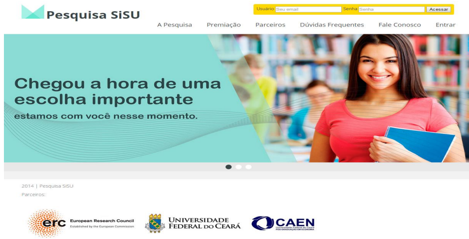
(a) Presentation Screen