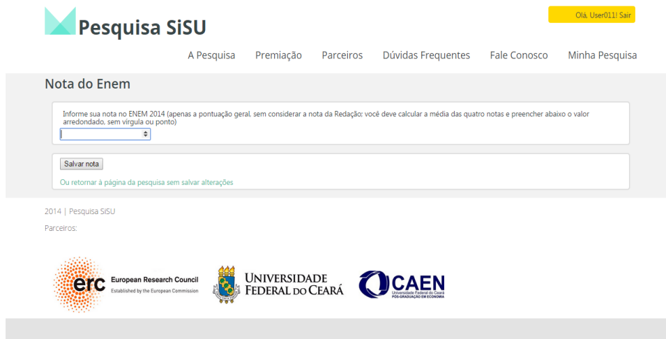
(b) ENEM Grades